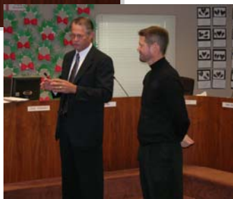
Go behind the scenes with local leaders.