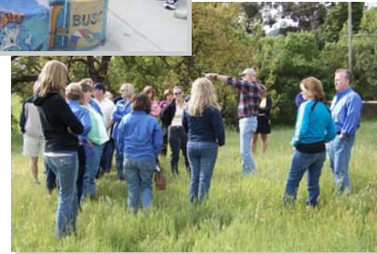
Learn valuable information about the local community.