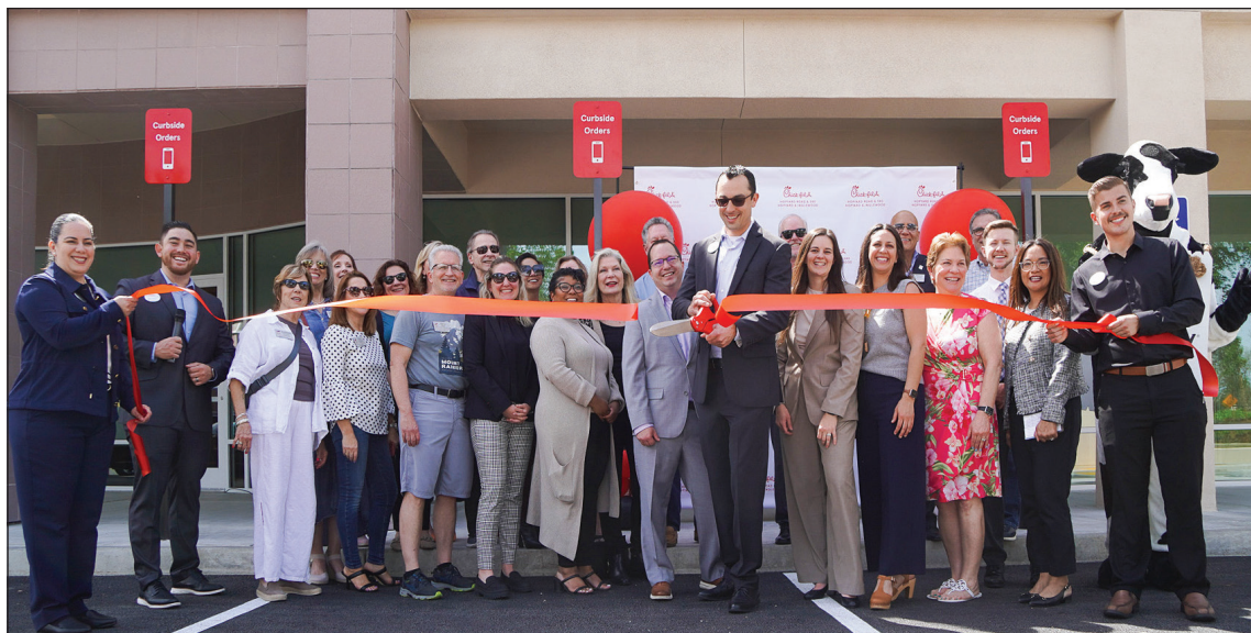
Friends, family, and members of the Pleasanton community celebrated the opening of Chick-fil-A Hopyard & Inglewood Road with an official Ribbon Cutting ceremony outside the restaurant.