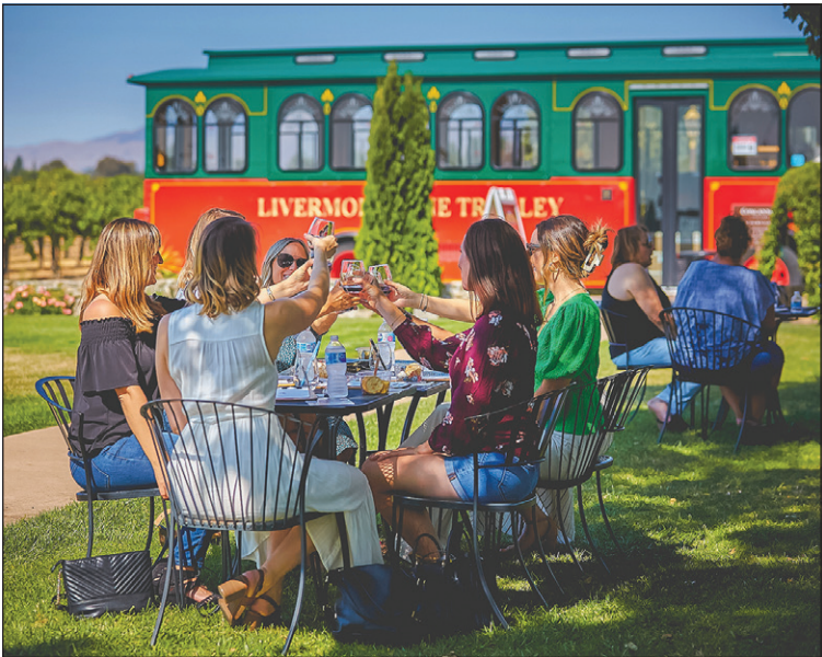
Livermore Wine Trolley