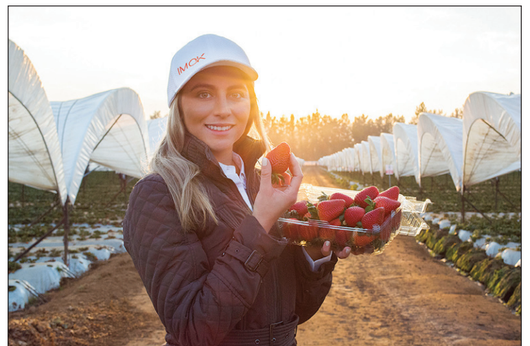
IMOK Global, LLC

IMOK Global's commitment to society extends beyond the realm of business. "In IMOK GLOBAL, we believe that giving to society makes us a better company." Our efforts to give back are evident in our sponsorship of various school and sports programs designed to nurture young