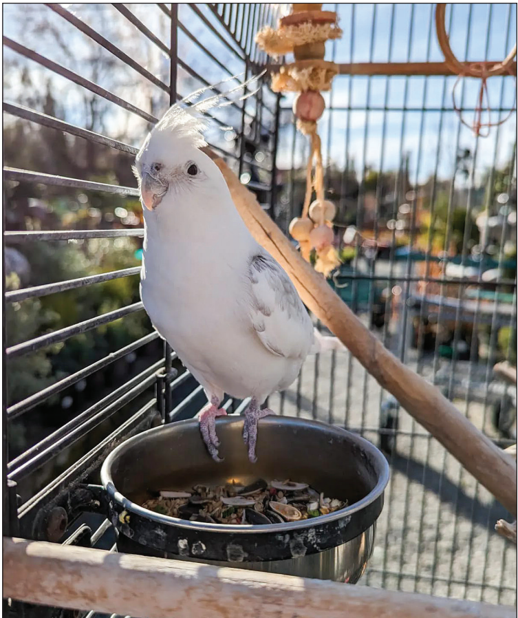
Western Garden Nursery

“Although time has a way of changing things, one thing remains constant, our commitment to top quality plants and customer service.”