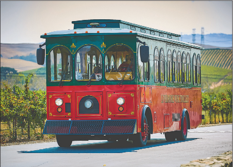
Livermore Wine Trolley

Cheers to unforgettable experiences and cherished moments with Livermore Wine Trolley!