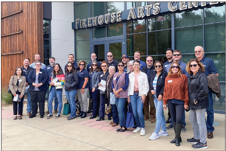
Participants of the Leadership Pleasanton class of 2024