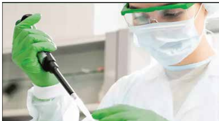
Bio-Rad - the global leader in innovative products for life science research and clinical diagnostics.

To further inspire future scientists, Bio-Rad offers scholarships to local high school seniors pursuing degrees in science and engineering. The company also supports charitable initia-