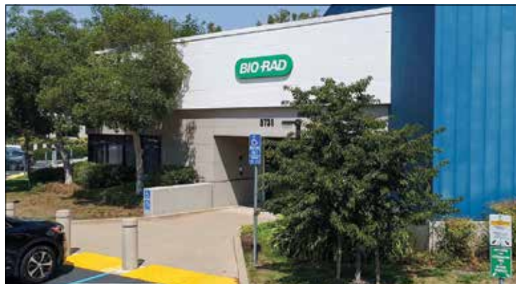
Bio-Rad Laboratories, Digital Biology Group is located at 5731 W. Las Positas Blvd. in Pleasanton.

tives, such as fundraising for diabetes and AIDS research and organizing internal events like its "Gobbler's Cup" food drive that benefit local food banks nation-wide.