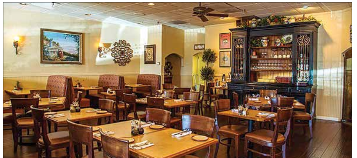
De La Torre's, a family-owned restaurant, has earned a loyal local following thanks to its flavorful cuisine, inviting atmosphere, and dedication to excellence.

Over the years, De La Torre's has earned a loyal following not only for its consistently great food but