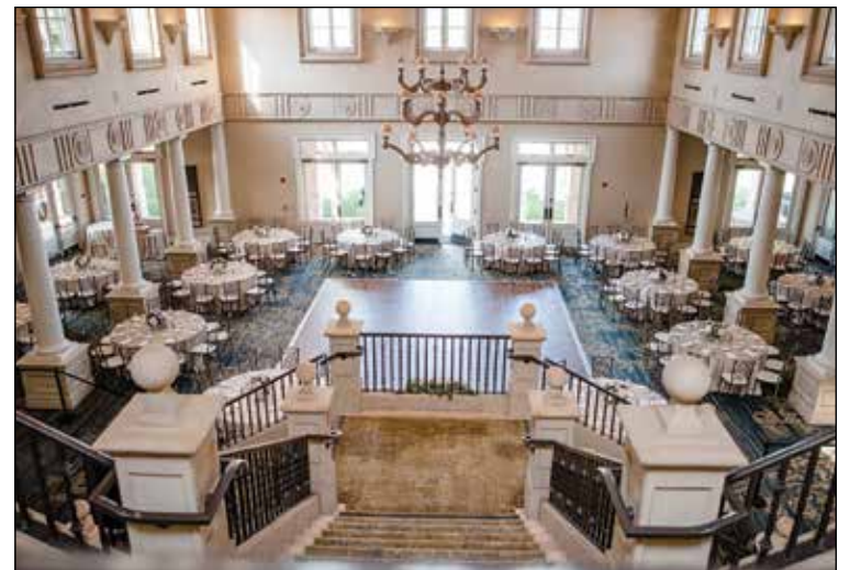
The Club at Ruby Hill is also a premier venue for weddings, private and corporate events.

Dining at The Club at Ruby Hill is a culinary experience all its own. Members enjoy seasonal menus served in elegant indoor spaces and scenic patios. Whether it's brunch,