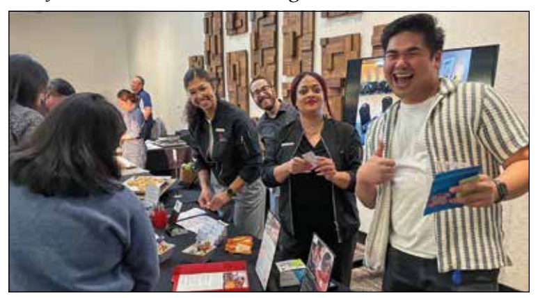
Members of the Marriott Pleasanton team at the Chamber's Fall 2024

With past tradeshows drawing crowds of over 200 attendees, this is not your average mixer-it's an energetic celebration of local business and community spirit.