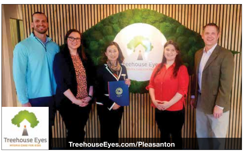
Treehouse Eyes — Protect your child's long-term eye health and help slow or stop their blurry distance vision from getting worse at Treehouse Eyes. Dr. Liu and the team specialize in managing childhood myopia, utilizing state-of-the-art equipment to create personalized treatment plans tailored to your child's needs. Their non-invasive treatments include customized contact lenses and specially formulated prescription eye drops. At your initial consultation, Dr. Liu will determine the treatment that is the most effective and safest option for your child. Learn more at TreehouseEyes.com/Pleasanton. Located at 3037 Hopyard Road, Suite J/K, Pleasanton.