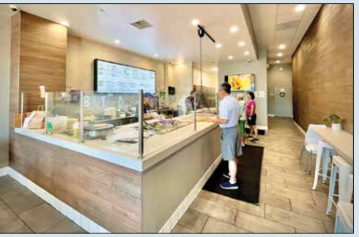
Hummus Republic brings together the vibrant flavors of the Mediterranean with the modern appeal of a "Build Your Own" concept.

Contact Hummus Republic at (925) 667-4026 or hummuslivermore@gmail.com. Website - www.thehummusrepublic.com. For Catering, call GG at (925) 999-6503.