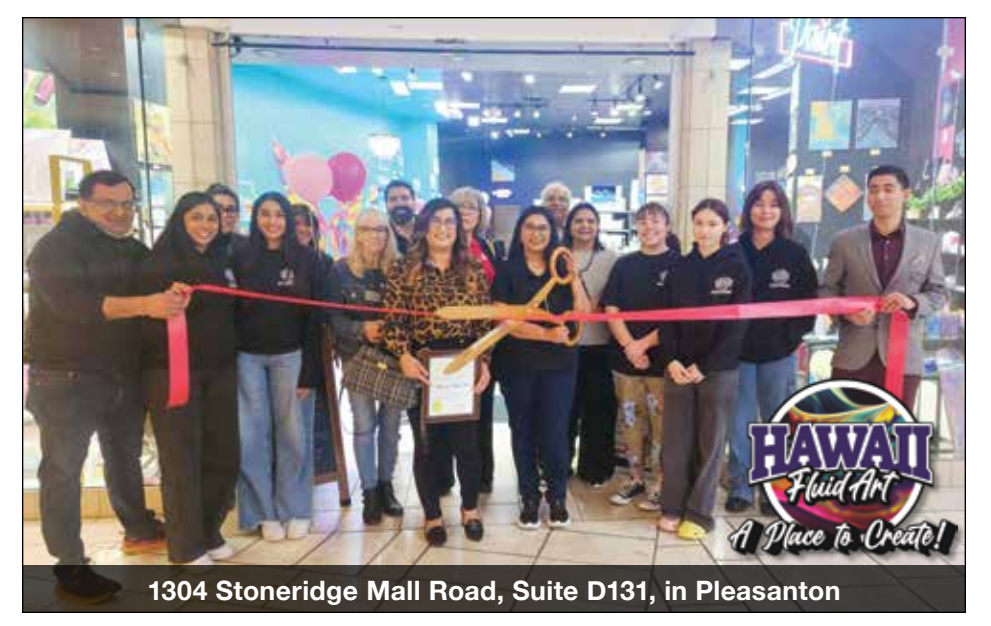
Hawaii Fluid Art — Hawaii Fluid Art is a nationwide art studio committed to giving everyone—no matter their experience—the chance to explore, create, and enjoy the world of art. Their fun, laid-back classes are perfect for all skill levels, offering a welcoming, semi-private, and professional environment where creativity can flourish. Whether you're looking for a one-of-a-kind experience, a fun night out with friends, or a new creative outlet, there's something for you here! They are now open at their new location: 1304 Stoneridge Mall Road, Suite D131, in Pleasanton.