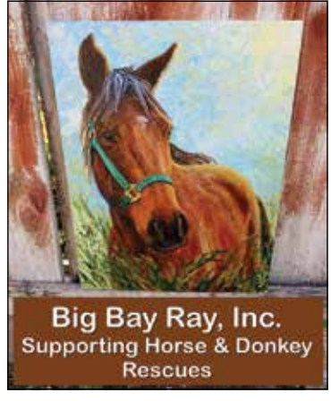
Together, we can make a difference — one feed bag at a time.

Learn more about our story at bigbayray.com.