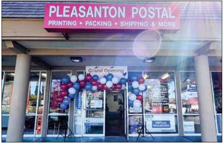
Visit Pleasanton Postal for all your shipping needs and more!

As they like to say at Pleasanton Postal, "We're a one-stop-shop for dozens of business products and