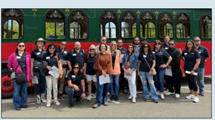
One of the highlights of Recreation Day was a tour of the Alameda County

The class is expected to be at capacity this summer with a maximum of 34 individuals. All interested participants must register by July 31, 2025, or until the class fills up. A limited number of sponsorship opportunities are available as well as partial scholarships for the program. For more information and online