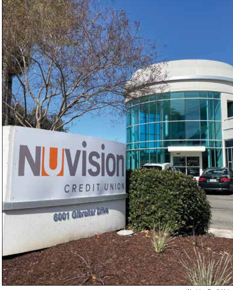
SafeAmerica's five branch locations, including its Pleasanton location at 6001 Gibraltar Drive, will remain open and transition to the Nuvision brand.

first home to saving for college or planning for retirement. Personal service and trust remain at the heart of everything Nuvision does.