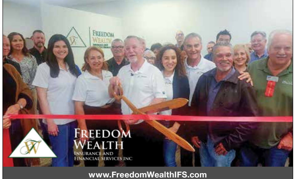
Freedom Wealth — Freedom Wealth Insurance and Financial Services is celebrating one year at their new office. With over 71 years of combined experience, the Freedom Wealth Team is dedicated to helping their clients with wealth accumulation, safeguarding assets, protecting families, and securing businesses. Our aim is to support individuals and businesses through life's various stages and assist in navigating any intricate financial choices you encounter. To learn more, visit our website at www.FreedomWealthIFS.com.