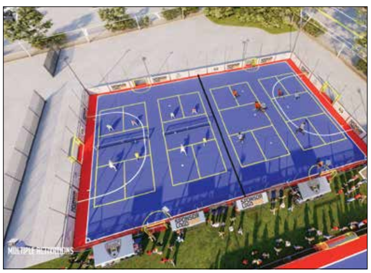
Rendering of the futsal complex set to open mid-summer 2025

This dream project has been years in the making, with many locations considered before partnering with the Alameda County Fairgrounds. The project's temporary nature allowed for a five-year event license, making the approval process smoother.