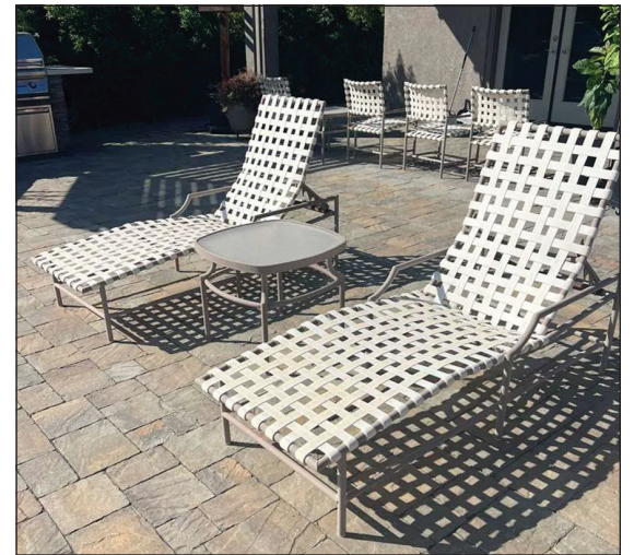
Custom outdoor cushions bring comfort and style to refreshed patio furniture, while patio loungers restored with new vinyl strapping offer a durable, updated look built to last.