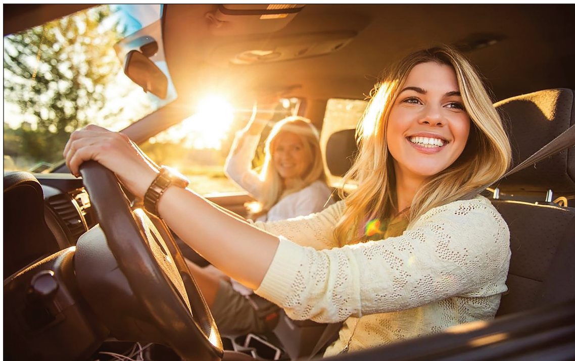
A vehicle travels along a Bay Area roadway, reflecting the everyday movement and mobility that relies on accessible, reliable, and affordable energy to keep communities connected.

Reliability matters every day, but it becomes especially important during heat waves, storms, or other disruptions, when dependable energy supports safety and resilience. Affordability matters just as much. Energy costs are part of household budgets and business expenses, and