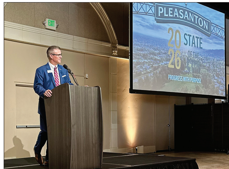
Mayor Jack Balch delivers the 2026 State of the City address, highlighting "progress with purpose" and Pleasanton's strong economic outlook.