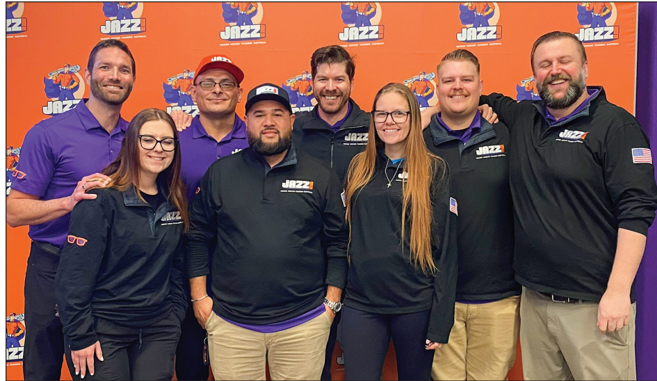
Jazz Heating, Air Conditioning & Plumbing staff gather as part of a growing Bay Area team dedicated to delivering trusted HVAC, plumbing, and electrical services built on family values, professionalism, and care.

In those early days, the business was truly a family effort, built from the ground up with everyone contributing in any way they could. Shortly after, his son-in-law joined the team, drawn by the opportunity to be part of something meaningful. Coming from a background in finance, he learned the trade from the ground up - running ductwork, installing