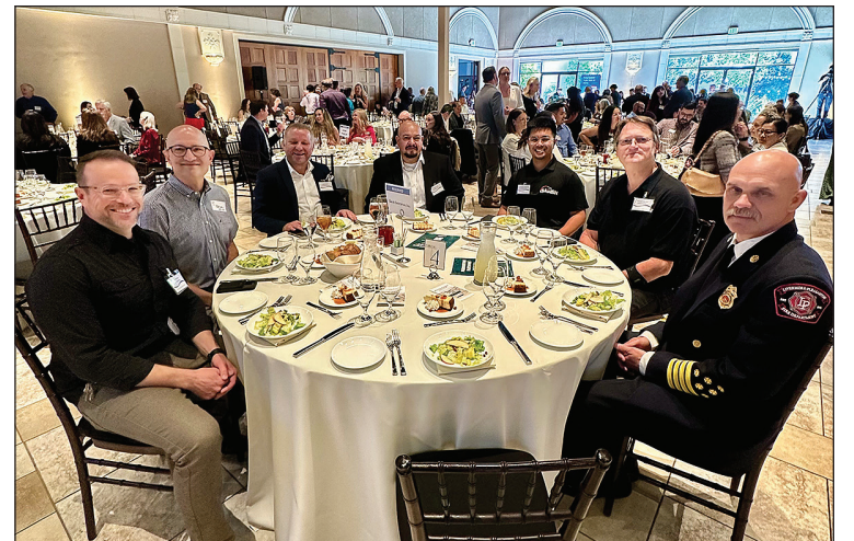
Attendees gather at the State of the City luncheon, connecting and engaging while enjoying the annual community update and program.