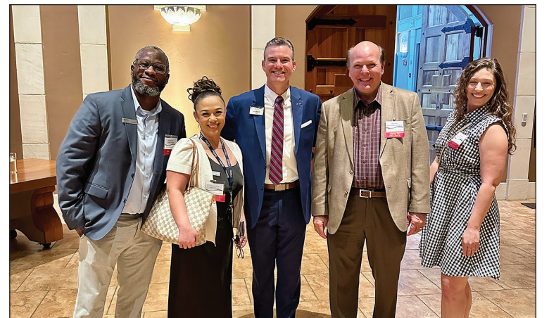
Guests network during the VIP reception, setting the tone for an afternoon of conversation, collaboration, and community connection.