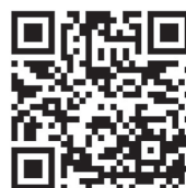
Scan to learn more

Bright Bins is a great example of how a specialized service can make a meaningful difference. It's not just about clean bins—it's about creating healthier, more pleasant spaces throughout our community.