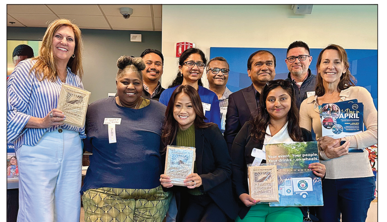
New Chamber members gather at the April Networking Mixer, joining fellow professionals for a morning of connection, conversation, and community engagement.

A sincere thank you to 1st United Credit Union for hosting and to all who attended and helped make the morning a success. The Chamber looks forward to continuing to expand its networking opportunities throughout the year.